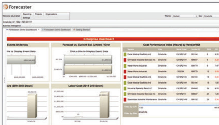
Enterprise Dashboard - CPI